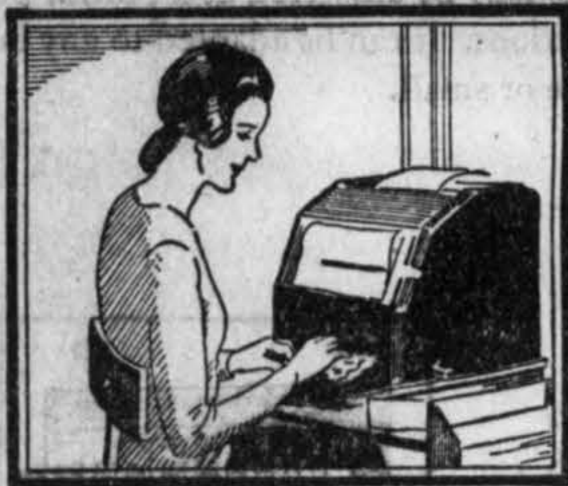
Subscriber line to "Central"