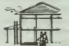
"VACANTS" AND UNDER CONSTRUCTION