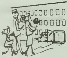
FAMILIES WHO RENT