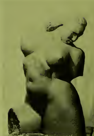
FEMALE OVERLIFE SIZE BRONZE