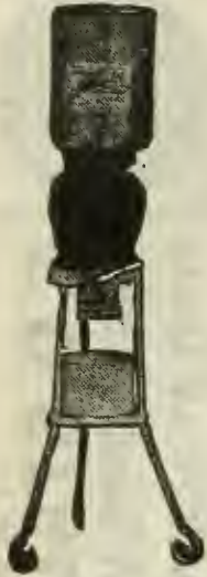
This Fixture Furnished Free

Soda, Syphon and Mineral Waters Ginger Ale and other Beverages 350 Fell St. - Phone Market 6516