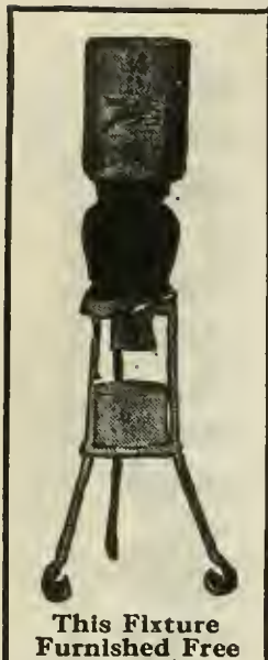
This Fixture Furnished Free

Soda, Syphon and Mineral Waters Ginger Ale and other Beverages 350 Fell St. - Phone Market 6516