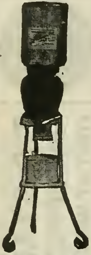
This Fixture Furnished Free

Soda, Syphon and Mineral Waters Ginger Ale and other Beverages 350 Fell St. - Phone Market 6516