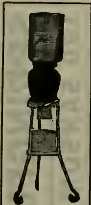
This Fixture Furnished Free

Soda, Syphon and Mineral Waters Ginger Ale and other Beverages