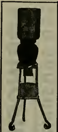
This Fixture Furnished Free

Soda, Syphon and Mineral Waters Ginger Ale and other Beverages Phone Market 6516 350 Fell St.