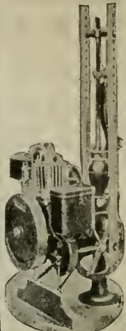
Silent Electric Automatic Pumping Outfits