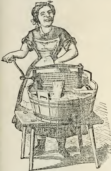
Boss Washing Machine.